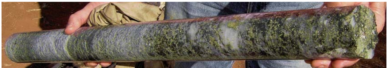
Fig 02 - Diamond Drill Core DODH007