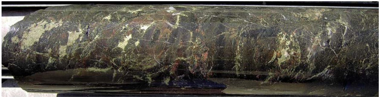
Fig 03 - Diamond Drill Core DODH008

The significance and extent of this zone will be investigated with further deep drilling from the south of Las Minerale Central.