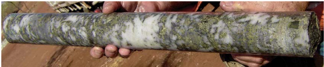
Fig 01 - Diamond Drill Core DODH007

Initially designed to intersect the Main Las Minerale ore body at over 500m true vertical depth, DODH 008 was drilled 100m behind drill hole DODH 007 which intersected significant mineralisation in several zones down to 360m true vertical depth, assays for which are still awaited.