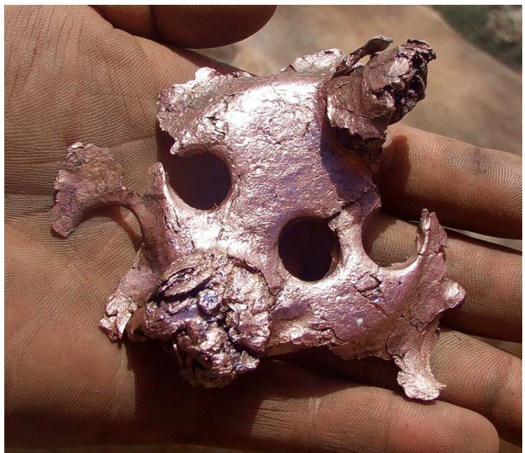
Fig 04 - Part of Native Copper Nugget caught in RC drill bit...